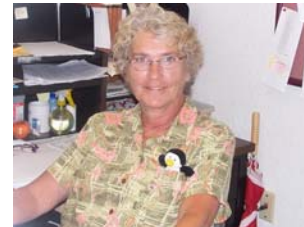
July AP Spotlight Employee